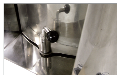
Door & Door Base